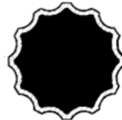
5" DIA. FLAT FLUTED SHAFT