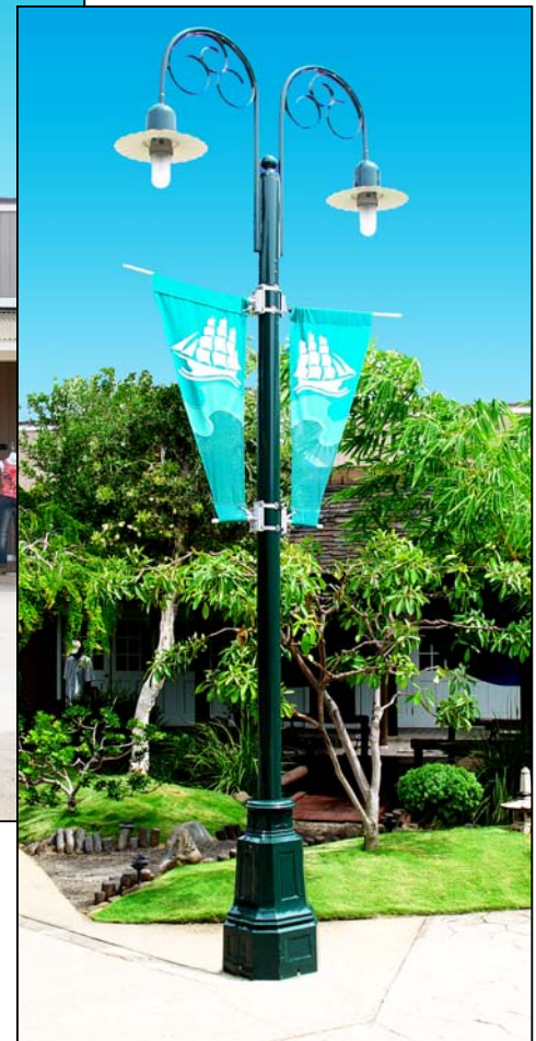
Lahaina Mall Hawaii