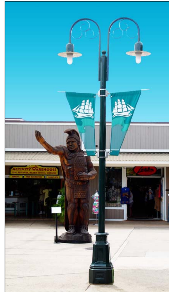
Lahaina Mall Hawaii

you're not planning a trip to Hawaii, give us a call. We will gladly send photos to you. Aloha!