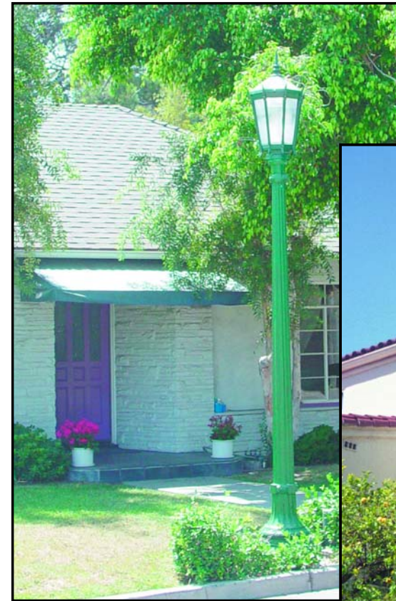
Hillcrest Park City of Fullerton

Other cities and government agencies located throughout the state of California have specified Sequoia Lighting's products for use in their redevelopment projects. Among the most recent include The City of Los Angeles, The City of Beverly Hills, The City of Santa Barbara, The City of Newport Beach and the State of California (CALTRANS).