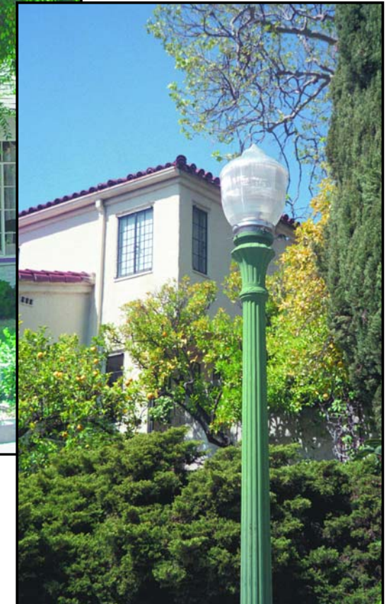
Adams Hill City of Glendale