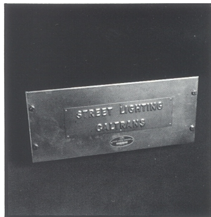
TYPE 9A PULLBOX

*1992 SPECIFICATIONS SHOWN, 1988 SPECIFICATIONS AVAILABLE